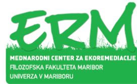
International Centre for Ecoremediation